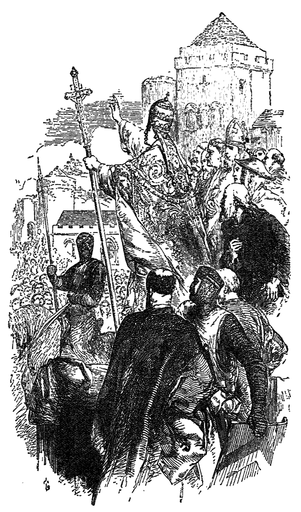
POPE URBAN PREACHING THE FIRST CRUSADE