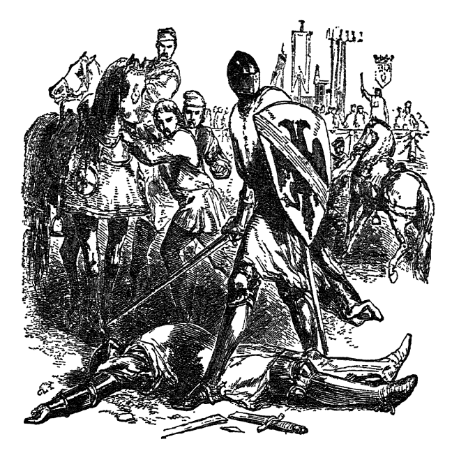
FIGHT BETWEEN DU GUESCLIN AND TROUSSEL