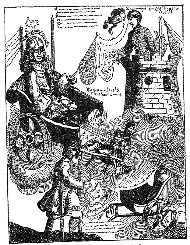
LAW IN A CAR DRAWN BY COCKS